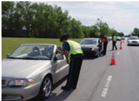
Conducted 793 check lanes