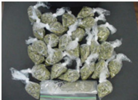
629 felony drug arrests