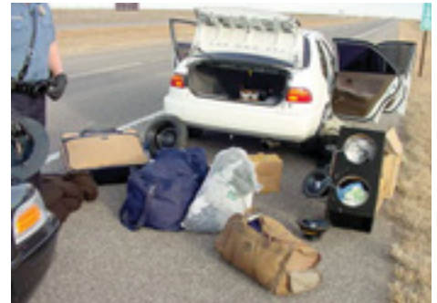
Conducted 2,823 criminal interdiction searches