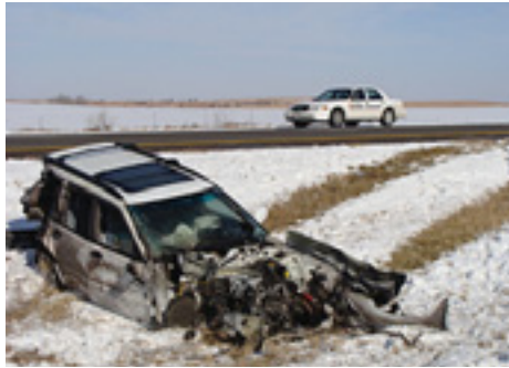
Investigated 197 fatality crashes, a reduction of 39 fatal crashes from 2007