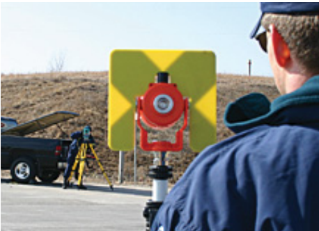
CHART responded to 112 requests for assistance, crash investigations, and crime scene reconstructions