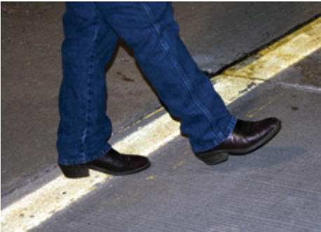
Administered 2,993 evidentiary alcohol tests