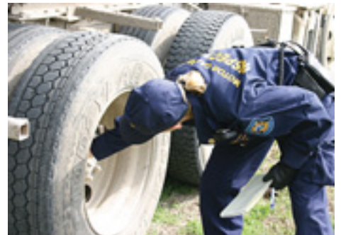
Inspected 44,609 trucks