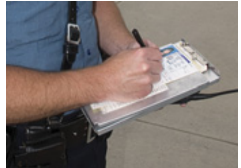
Issued 15,499 seat belt violations