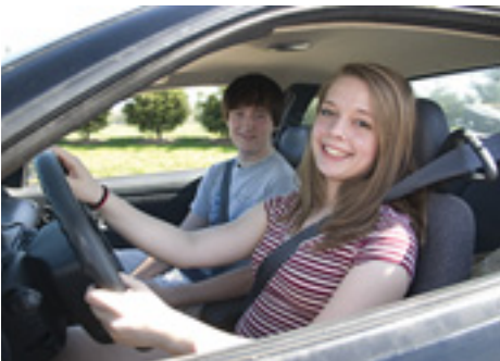
Seat belt use in Kansas increased to 77%