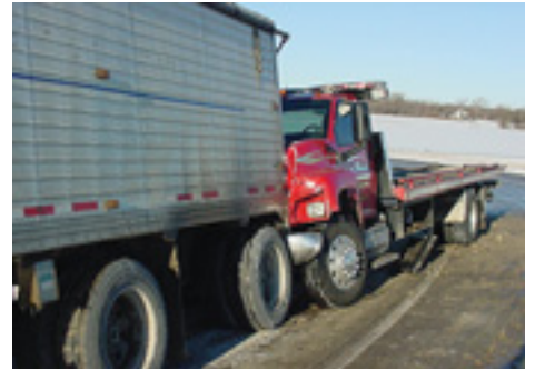
Investigated 2,139 injury crashes