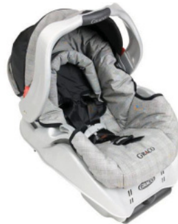
Issued 4,144 child restraint violations