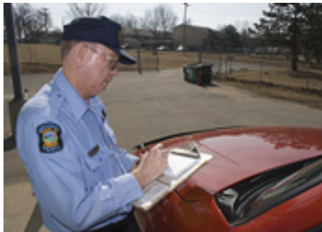
Inspected 149,858 vehicle identification numbers