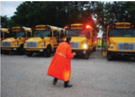
Inspected 9,526 school buses