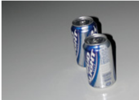
Arrested 3,400 impaired drivers