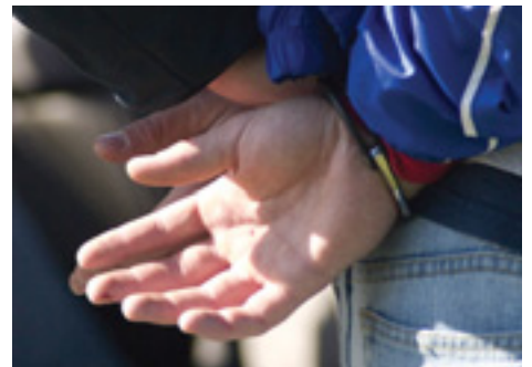
969 felony arrests