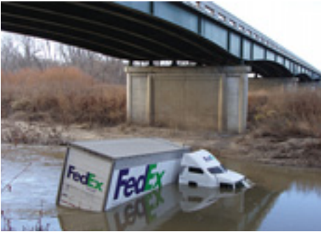
Investigated 7,212 property-damage only crashes