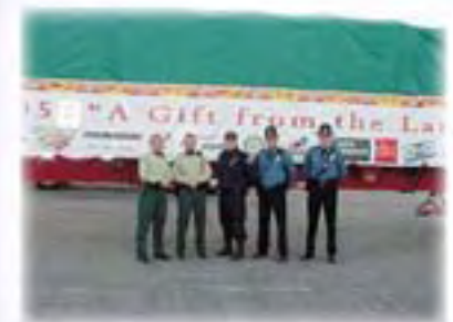
TROOPERS ENSURE SAFETY OF HOLIDAY TREE