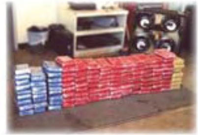
DRUG SEIZURE LEADS TO MULTIPLE ARRESTS

Troopers responded to Barton County on August 19 for a severe thunderstorm that produced numerous tornados. Troopers spotted several tornados and warned the public. KHP members assisted local officials by forming teams to conduct damage assessments in Great Bend. Thirty-seven structures in Barton County were damaged and several rural residences were destroyed. The Patrol's helicopter pilots in Salina flew Great Bend officials over the damaged areas the following morning.