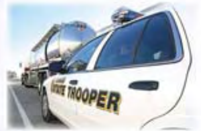
A HUNT FOR STOLEN OIL