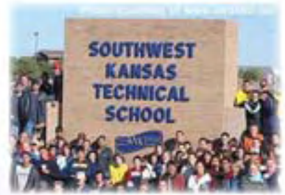
EDUCATE FUTURE TRUCK DRIVERS

Troop E had the opportunity to assist with our nation's Holiday Tree again in 2005. As the tree made its way to Washington D.C., the Holiday Tree spent the night in Dodge City. The U.S. Forestry Service contacted the Patrol for overnight security. The security was necessary due to an event in 2004, in which the convoy team stopped an individual attempting to approach the tree with a chain saw. The overnight stay was a success.