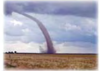
TROOPERS SERVE AS STORM SPOTTERS