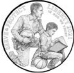
2021 NATIONAL LAW ENFORCEMENT MEMORIAL AND MUSEUM SILVER DOLLAR

The anticipated delivery date is in May 2021.