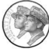
2021 NATIONAL LAW ENFORCEMENT MEMORIAL AND MUSEUM FIVE-DOLLAR GOLD COIN

Struck in 99.9-percent silver and bears the "P" mark of the Philadelphia Mint.