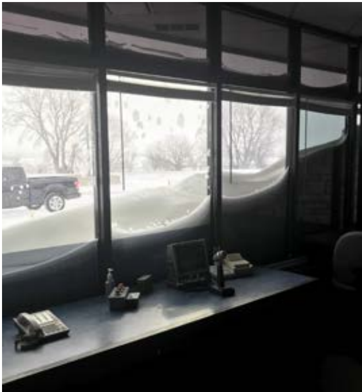
02/15/21: The South Haven scalehouse was closed due to drifting snow. At some locations, the snow drifted against the building and almost to the roof.