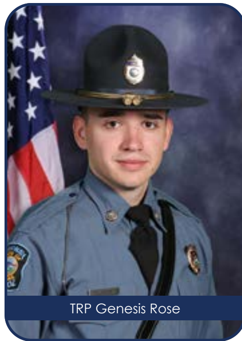
TRP Genesis Rose